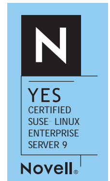
on light colors