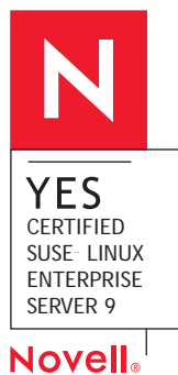
2 color mark