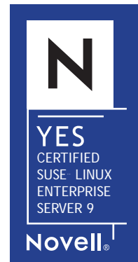
on dark colors