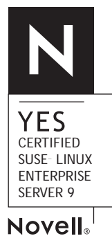
1 color mark